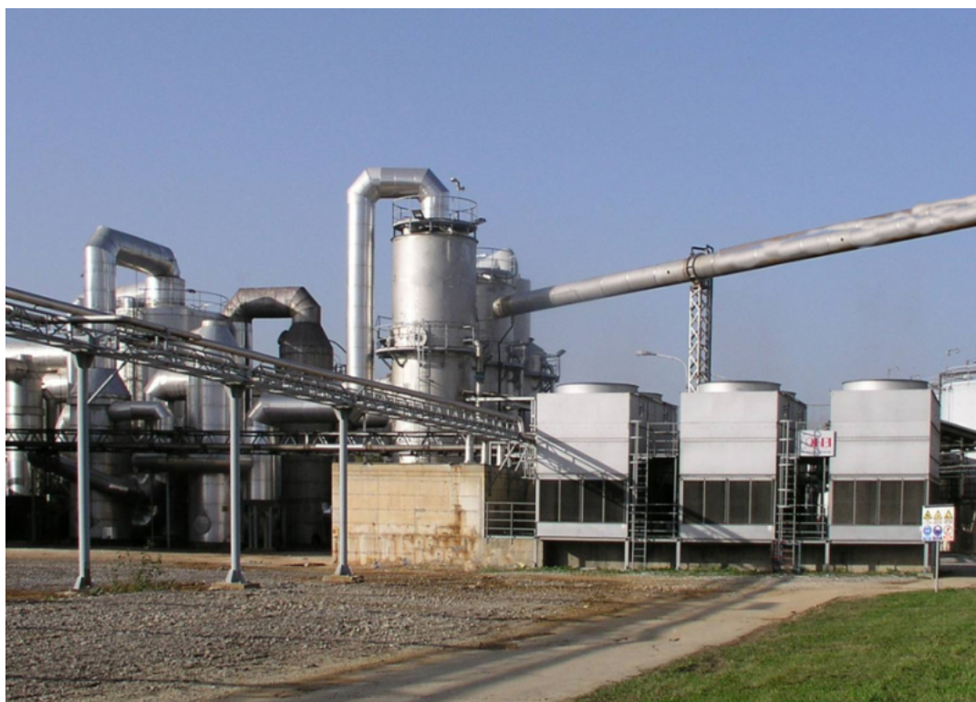
Pic. 2: Complete revamped Sulphuric Acid DC-Plant (600 tpd) with PINC™