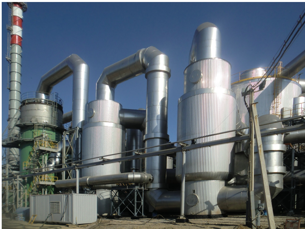
Pic. 1: 2,000 tpd Sulphuric Acid DC-Plant based on sulphur burning with PINC™