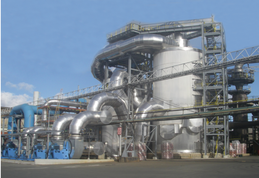
Pic. 3: Wet-Gas-Cleaning Plant down a Mo-roasting plant PINC™