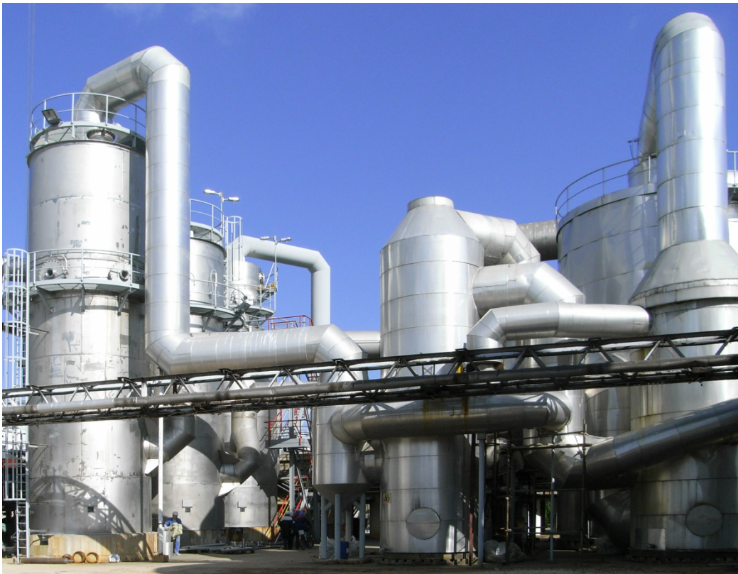
Pic. 4: S-Burning-Plant 740 tpd Mh based on PINC™